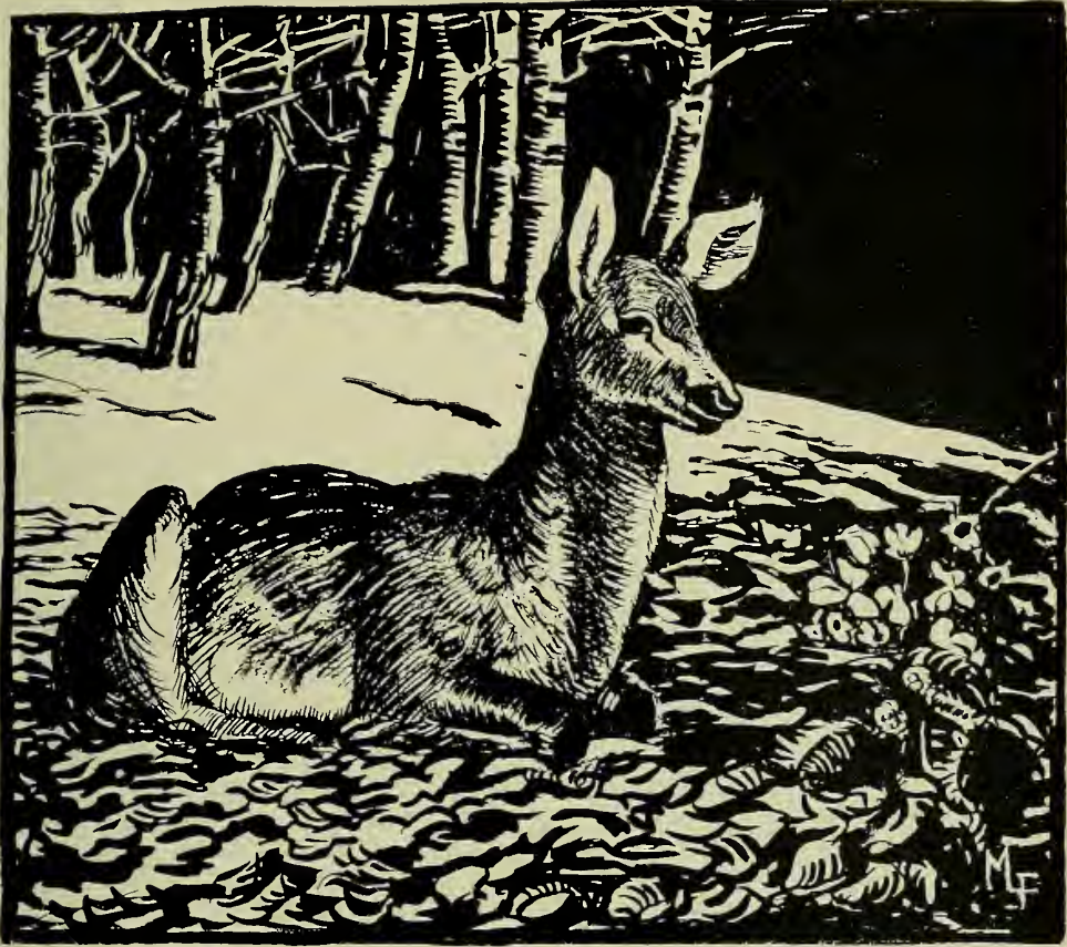
THE BOY WENT INTO THE FOREST WITH HIS BOW AND ARROWS. HE HAD NOT GONE FAR WHEN HE SAW A FAT YOUNG DEER, WHICH HE KILLED